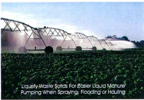
Liquefy Waste Solids For Easier Liquid Manure Pumping When Spraying, Flooding or Hauling

Before irrigation, manure liquids treated with BioPacks will: