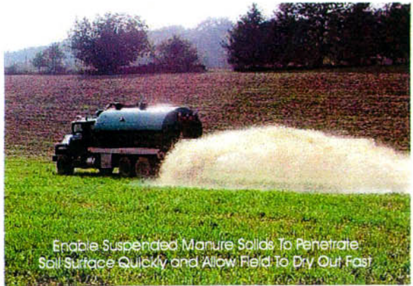
Enable Suspended Manure Solids To Penetrate Soil Surface Quickly and Allow Field To Dry Out Fast