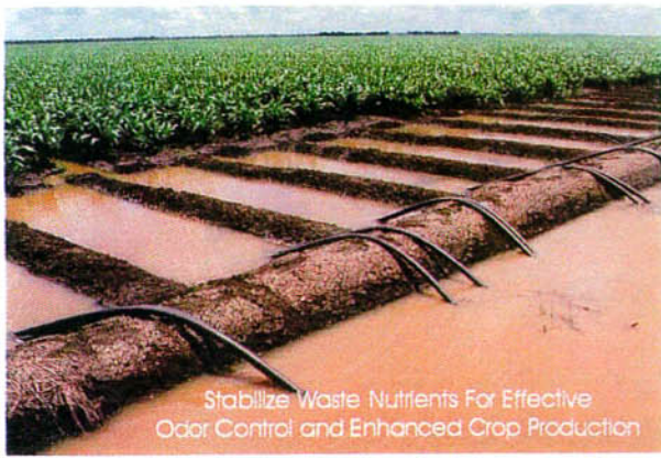
Stabilize Waste Nutrients For Effective Odor Control and Enhanced Crop Production